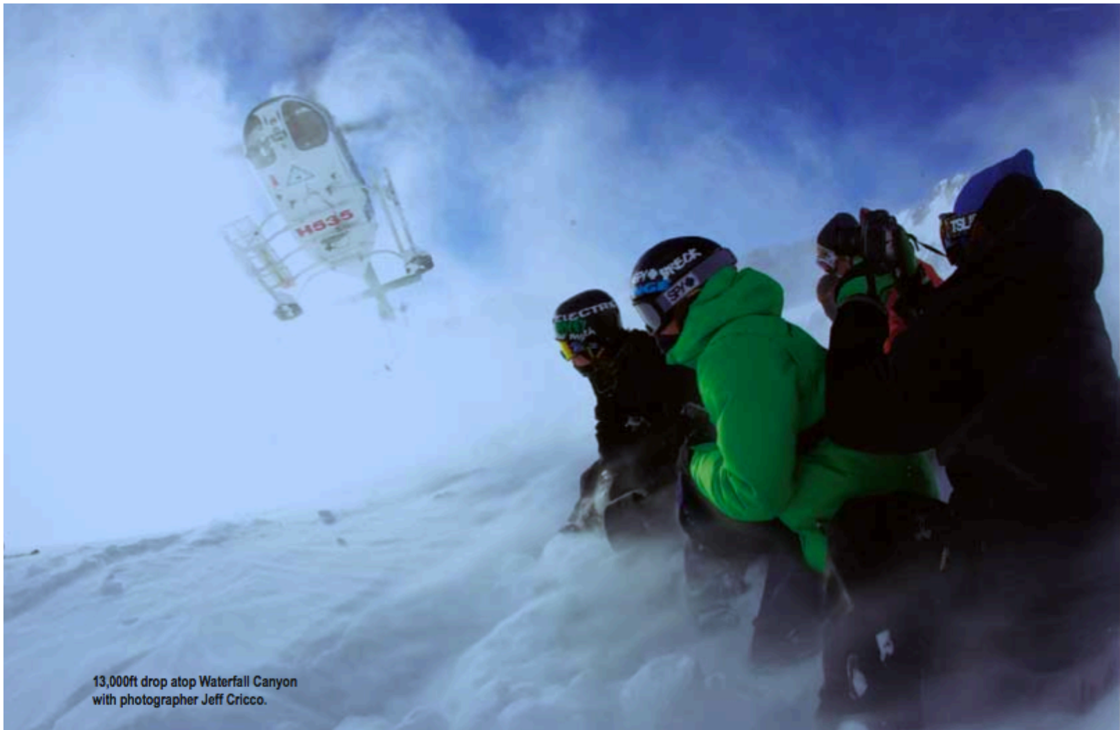
13,000ft drop atop Waterfall Canyon with photographer Jeff Crizzo.