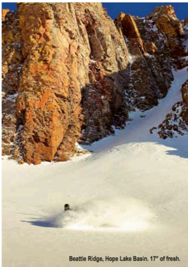
Beattie Ridge, Hope Lake Basin. 17" of fresh.