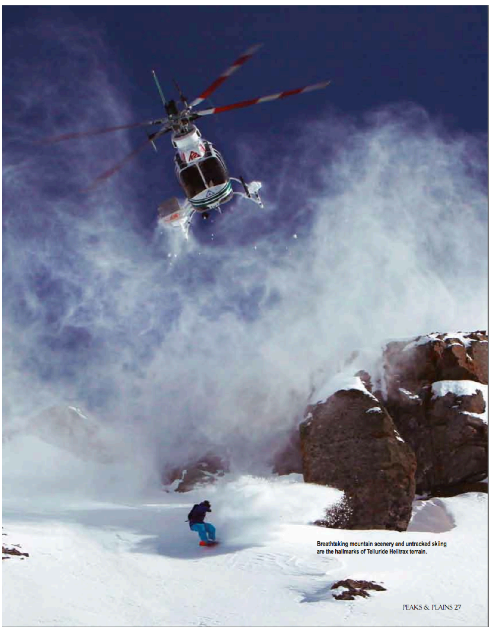
Breathtaking mountain scenery and untracked skiing are the hallmarks of Telluride Helitrax terrain.